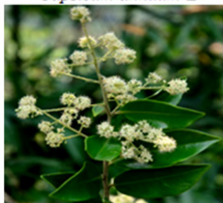
Embelia ribes Burm