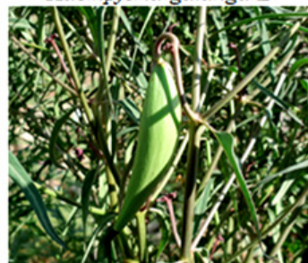
Cynanchum thesioides (Freyn) K. Schum