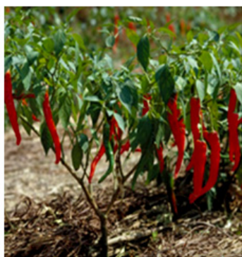
Capsicum annuum L