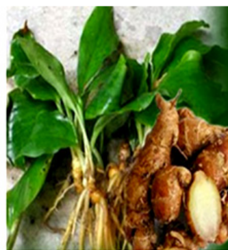
Kaempferia galanga L