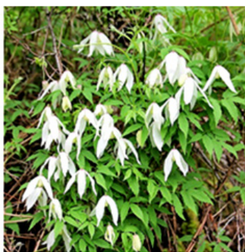
Atrage sibirica L