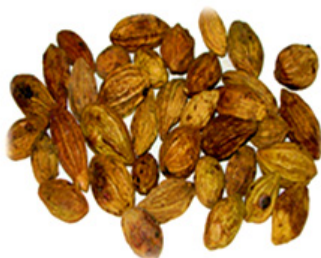
Terminalia chebula Retz