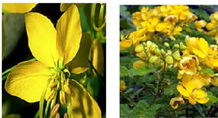
Fig. 1a & b: Flower and Branches of Cassia fistula