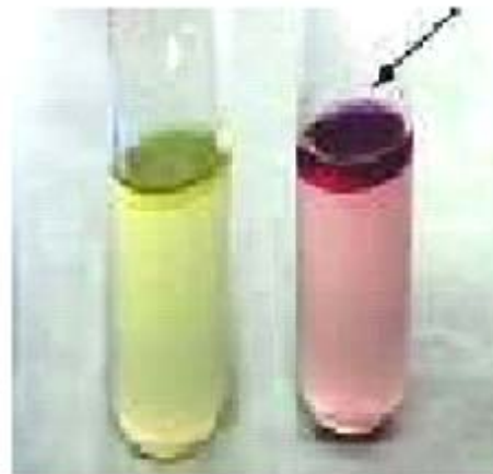
Fig. 2: Voges prauskar test