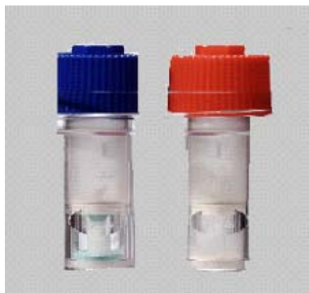
Fig. 5: Latex agglutination tube

diagnosis of typhoid. All the blood samples were subjected for widal test all the 50 blood samples were shown positive for widal test there titer were varied from 60 to 120 ratio. All the 50 patients shown positive for widal, urine sample were collected and subjected for culture on Nutrient medium and incubated the plates for 24hrs at 36c in an incubator based on the growth and morphology on culture plates this colonines were transferred to Nutrient broth and performed different microbial tests like staining, motility, biochemical, selected media for bacterial identification. By Gramstaining all the isolated obtained during growth were grains negative and motile bacteria. Out of 50 bacterial