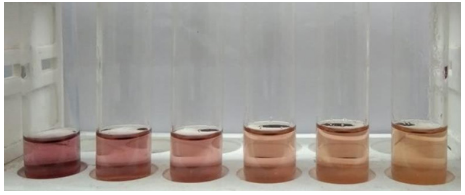
Fig. 3. Showing antioxidant activity in DPPH assay