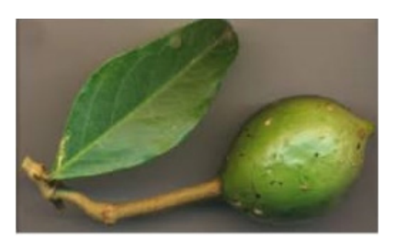
Fig. 1. Showing the unripe fruit of Capparis zeylanica

The Phytochemical analyses was done according to described methods<sup>5</sup>. The DPPH radical scavenging capacity of rhizome extracts was measured using the classically described methods. Twelve mg of DPPH was dissolved in 50 ml of methanol to make a stock solution. Diluting the stock solution to achieve an absorbance of 1.05 yielded the working solution. 2. 8 ml of the