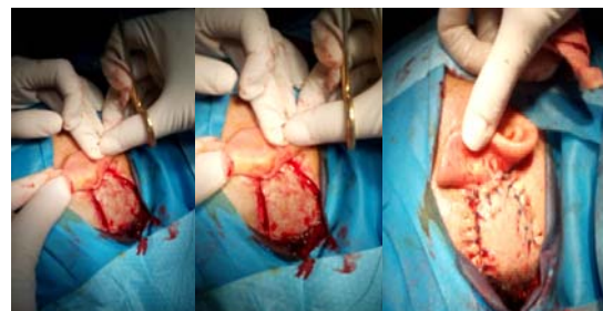
Fig. 4: Closure of the wound