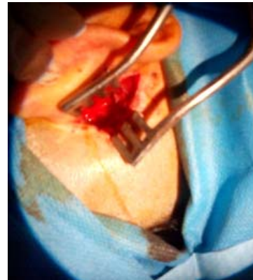
Fig. 2: Fistula tract dissected out completely