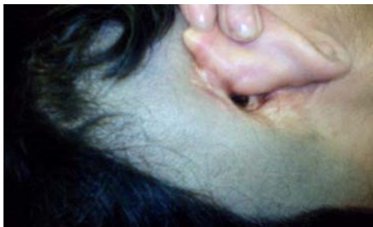
Fig. 1: Postauricular cutaneous mastoid fistula

This technique has been successfully used in Our Case. She was a 45-year-old woman with Post auricular mastoid cutaneous fistula after canal wall down mastoidectomy. She has been followed up for 6 months and no reoccurrence was observed.