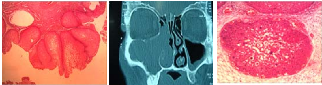
Pathology of inverted papilloma Right side inverted papilloma Carcinoma insitue in inverted papilloma