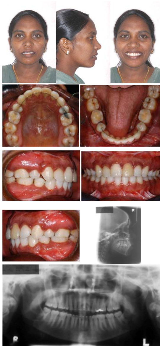
Fig. 5: Post treatment Intraoral and extraoral records

The patient was planned for orthognathic surgery well before any orthodontic procedures