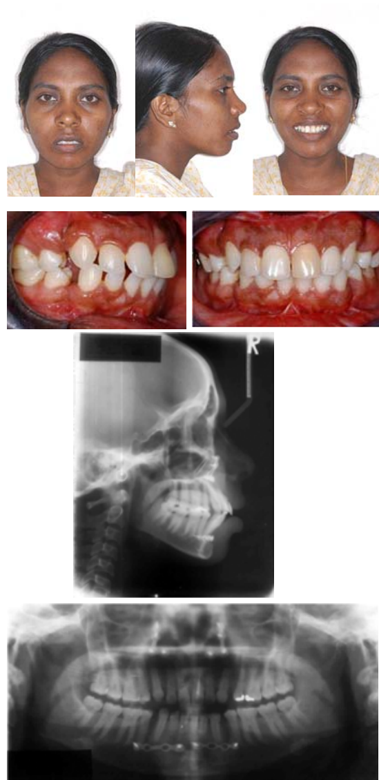
Fig. 3: Post surgical extraoral and intraoral photograph (Surgery first)