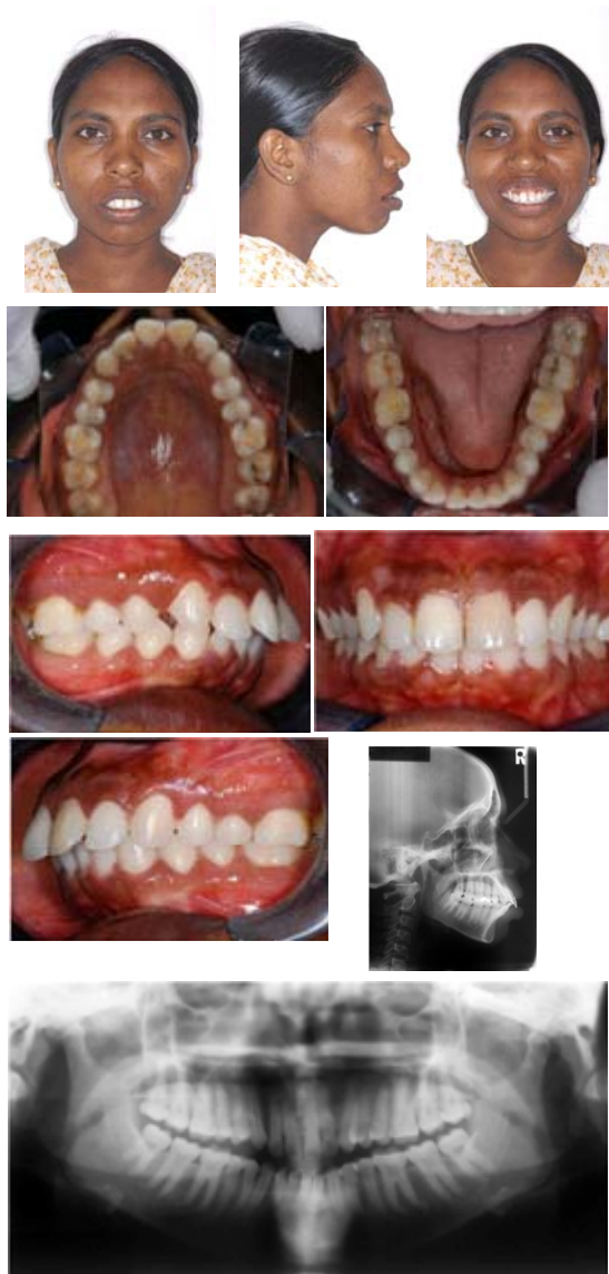
Fig. 1: Pretreatment Extraoral and Intraoral records