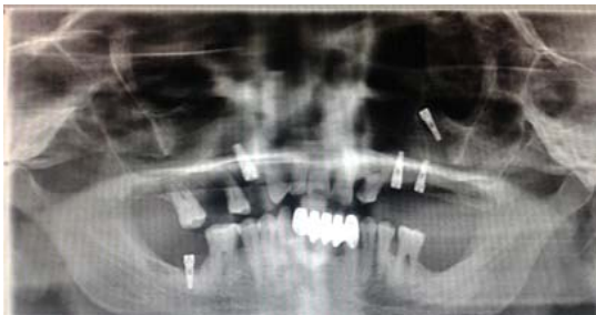
Fig. 2: OPG 6 month post operative after implant placement, implant displaced in the maxillary sinus