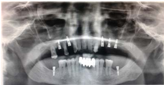
Fig. 1: OPG after implant placement

found to have dislodged to the maxillary sinus region. Patient was asymptomatic and did not give any history of pain. Standard Caldwell-Luc surgical technique under local anesthesia was used to create a small osteotomy in the lateral antral wall in the region of the dislocated implant. The size of the opening was restricted but sufficient to allow passage of the implant. The implant and the cover screw were easily retrieved with a vascular forceps. A homogenous bone graft from a bone bank was performed after elevation of the Schneiderian membrane from the floor of the maxillary sinus, to a future placement of another dental implant (Fig 3).