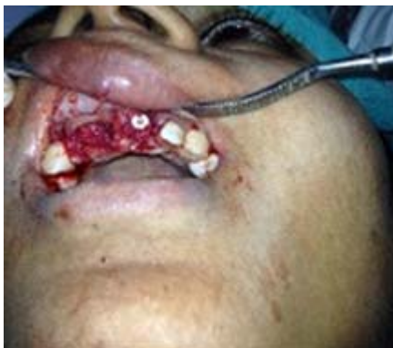
Fig. 5: Placement of hydroxyapatite nano particles