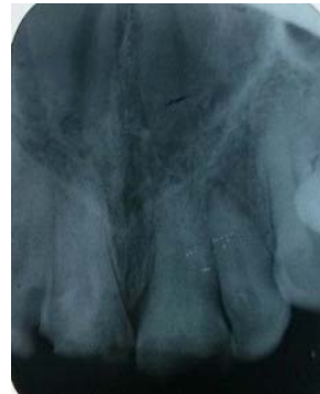
Fig. 2: Pre operative iopa