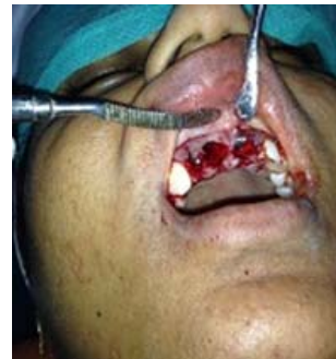
Fig. 4: Placement of implants