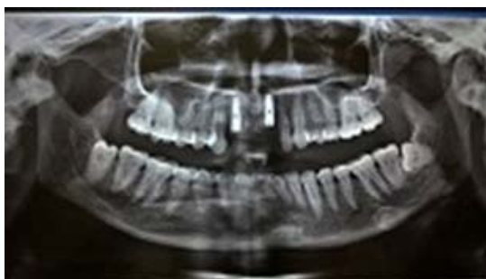
Fig 7: Fifth month post operative OPG

These hydroxyapatite crystals get resorbed by four weeks thus inducing the osteoblast effect surrounding the implant .These HA particles are three times more stronger than cortical bone hence gives good stability to implants and immediate post operative radiograph taken( FIG 6) ,following fifth month review was done ( FIG 7) and OPG reveals a definitive bone formation around the implant thus providing more stability and less chances of failures of the implant less bone loss as noted comparatively to implants without hydroxyapatite nano particles.