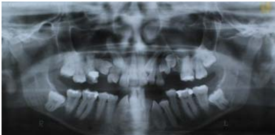
Fig 3. Pre-treatment panoramic radiograph.