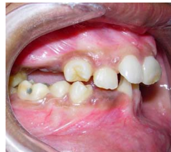
Fig. 1(b): Pre-treatment intra-oral-Right