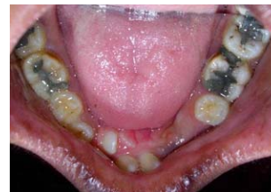
Fig. 1(e): Pre-treatment intra-oral-Lower Occlusal