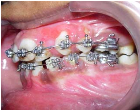
Fig 4. Surgical exposure and orthodontic traction