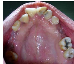
Fig. 1(d): Pre-treatment intra-oral-Upper Occlusal