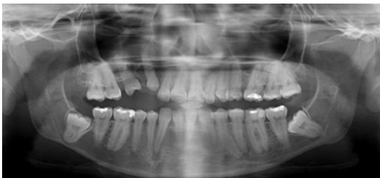
Fig. 5: Post-treatment panoramic radiograph

for the orthodontic traction of 13 and 25 which was ectopically placed was surgically removed due to poor prognosis. 32 and 42 too were surgically removed. Subsequent to maintaining a moistureless field in the vicinity of the impacted teeth, these teeth were bonded with their respective brackets with a dangling stainless steel ligature wire to assist in closed orthodontic traction. The flaps were subsequently closed back and sutured. After a week the sutures were removed and orthodontic traction was commenced with light force. (Fig 4). After successful orthodontic traction, leveling and alignment was done with 0.014 and 0.016 inch nickle titanium archwires. Space consolidation was done with 0.017 x 0.025 stainless steel archwires and final detailing and finishing with 0.019 x 0.025 stainless steel archwires.