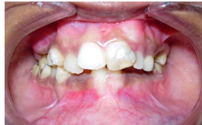
Fig. 1(a): Pre-treatment intra-oral-Frontal

Deeply carious 16 and retained 63 were extracted. Pre adjusted edgewise appliance, Roth's prescription .018 inch slot was strapped up prior to the surgical procedure. Flaps were raised in the maxillary and the mandibular dental arches and the severely rotated 14 which was an impediment