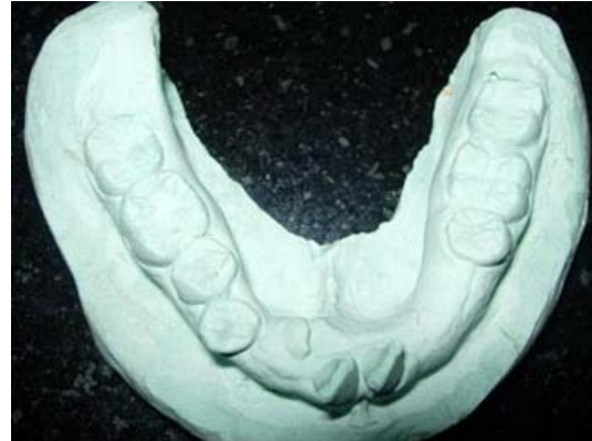
Fig. 2(b): Pre-treatment mandibular cast