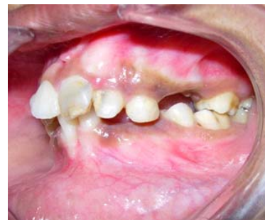
Fig. 1(c): Pre-treatment intra-oral-Left