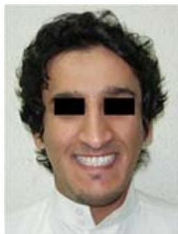
Fig 8c. Post treatment extra oral - Smiling