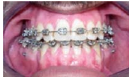
Fig. 7: Final aligning and leveling – Frontal