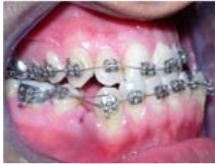
Fig. 4: Aligning and leveling – Upper and lower 0.016 inch nickel titanium archwires – Right