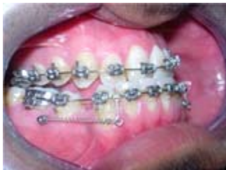
Fig. 6. Space closure – Upper and lower 0.016 x 0.022 inch Stainless Steel archwires with nickel titanium retraction coil spring attached to the crimpable hook and the microimplant – Right