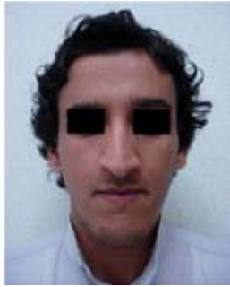
Fig. 1(a): Pre treatment extra-oral-Frontal