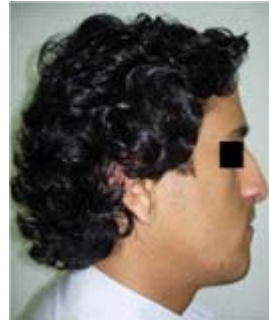
Fig.1(b): Pre treatment extra-oral-Profile