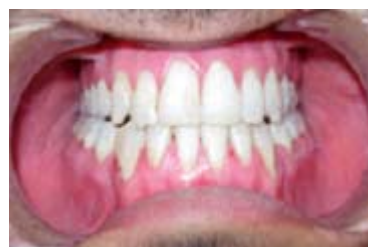
Fig. 8(d). Post treatment-intra-oral-Frontal