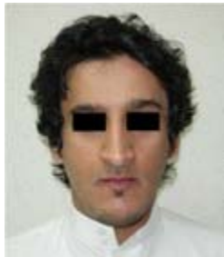
Fig. 8(a): Post-treatment extra-oral-Frontal