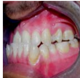
Fig.1(f): Pre treatment intra-oral-Left