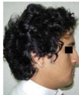
Fig. 8(b): Post-treatment extra-oral-Profile