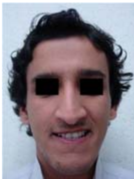
Fig.1(c): Pre treatment extra-oral – Smiling