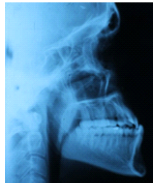
Fig. 3: Pre treatment lateral cephalometric radiograph