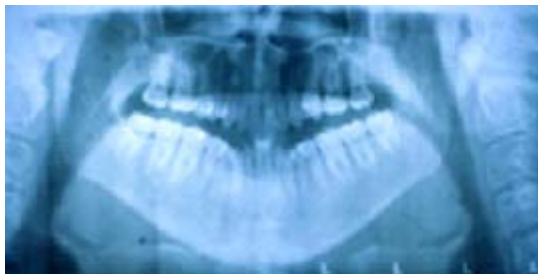
Fig. 2: Pre treatment OPG