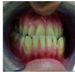
Fig.1(d): Pre treatment intra-oral-Frontal.