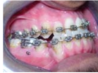
Fig. 5: SH1312 microimplant of diameter 1.3mm and length 8mm inserted between 45 and 46- Right