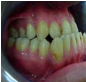
Fig. 1(e): Pre treatment intra-oral-Right.