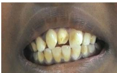
Fig. 1 : Showing presence of mesiodens

The ability to properly evaluate ST to determine their relation with adjacent teeth and other anatomical structures is important for the