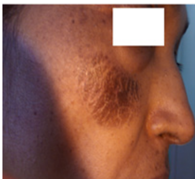
Fig. 3. TSDF –Melesma