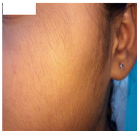
Fig. 2. TSDF- Hirsutism