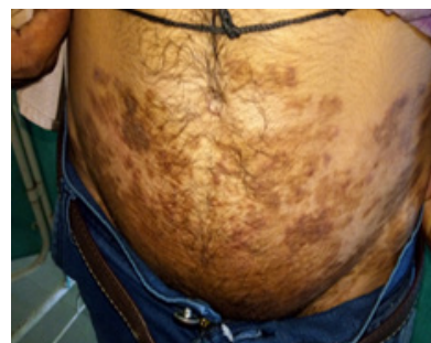
Fig. 6. Tinea Cruris in male