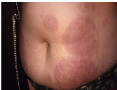
Fig. 5. Tinea Corporis in female