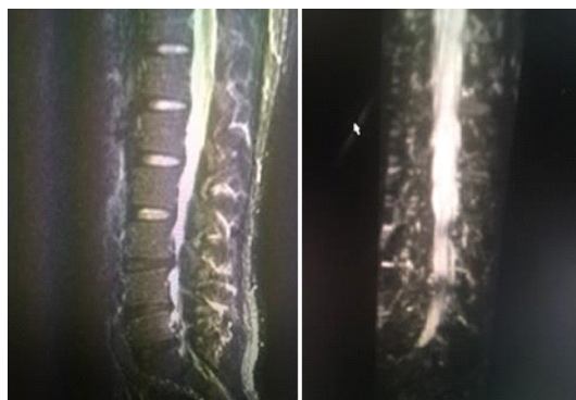
Fig. 1. A-B. Spine MRI shows canal compromise due to HFL. (A) Sagittal T2-weighted MRI shows hypertrophy of flavum ligament (HFL) from L1-S1 levels with additional disc bulging on L3-S1 causing narrow lumbar canal. (B) Coronal MR-Myelogram shows significant lumbar canal stenosis at L3-S1 levels

There were 32 patients with lumbar stenosis who underwent laminectomy decompression stabilization fusion by the single author between January 2015 and May 2017. All patients were treated in a rehabilitation unit for four weeks and indicated for surgery due to neurogenic claudication that can not be managed by physical therapy or medication. The preoperative radiographic examination included plain spine x-ray, computed tomography (CT) scan and magnetic resonance (MRI) imaging. Patients with lumbar stenosis