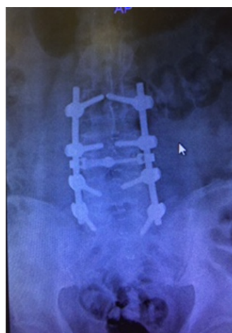
Fig. 2. Postoperative Lumbar x-ray showing area of laminectomy and instrumentation. Postoperative plain Lumbar x-ray shows acceptable pedicle screws placement on L3-S1 levels with visible shadow of empty area after laminectomy from L3-S1 levels

In this study, data was evaluated using a student's t-test analysis on the NCOS pre- and postoperative to evaluate the improvement significance. All analyses were performed with SPSS version 21. P-value of 0.05 was considered as statistically significant.