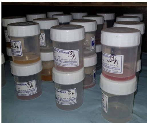
Fig. 1. Collected Saliva Samples

Therefore depending on their composition, frequency of application, and length of therapy, the oral health of children undergoing treatment should be monitored. This fact we attribute to its high sucrose content, its low viscosity, and its acidic endogenous pH.