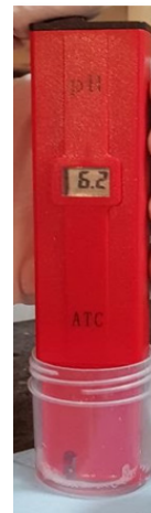
Fig. 2. pH meter indicating the levels