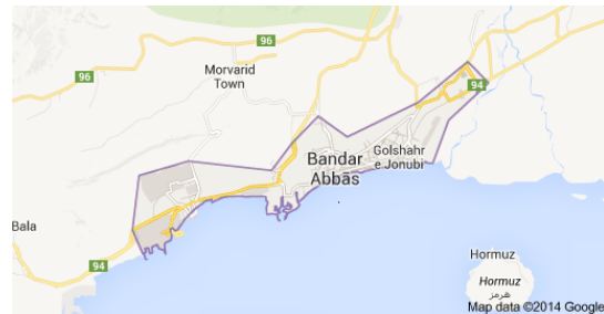
Fig. 1: Location of A. podolobus samples collection

hill area having elevation ranging from 860 m to 3,081 m. Annual rainfall is 214 mm, mean temperature is 24.33°C, average maximum temperature is 31.25°C, and average minimum is 17.35°C. The soils of the study area are mostly shallow and therefore are only suitable as rangeland for herd grazing. According to the American system of soil taxonomy 15 , the soils of the region are classified in as Entisols.