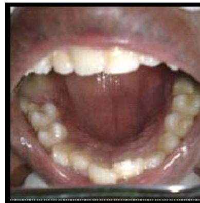
Fig. 3: Intra Oral Photograph-High Arched Palate