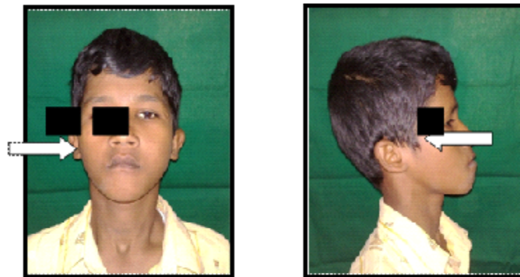
Fig. 1: Extra Oral Photograph-Front and Lateral Profile View

The skeletal changes in Binder's syndrome have a direct impact on patients' facial features. The anterior crest separating the floor of nasal cavity is missing, and the anterior nasal spine can be either hypoplastic or missing. This results in a flat profile without nasal prominence 1,11 . The scaphoid depression that researchers observe lies