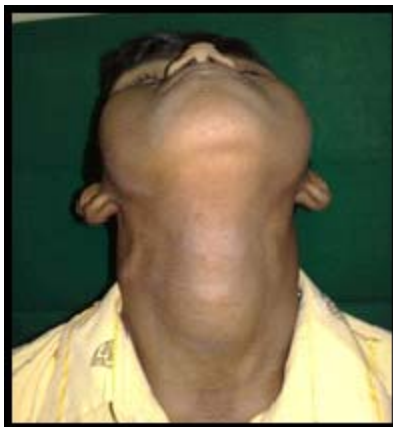
Fig. 2: Thyroid Swelling In The Neck