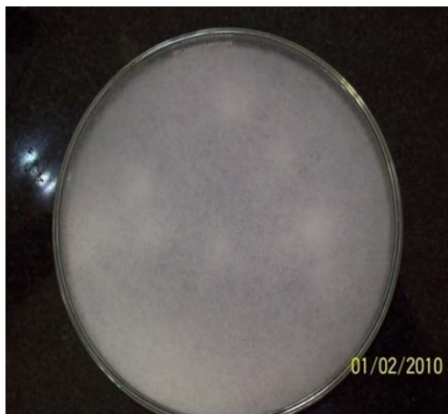
Fig. 1: Picture showing Rhizopus Oryzae grown on PDA media

organic solvent, and thus the enzymatic process becomes environmentally benign 4, 14 .