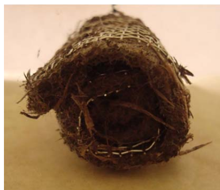
Fig. 3: Pictures of fibrous matrix after (C and D) cell immobilization