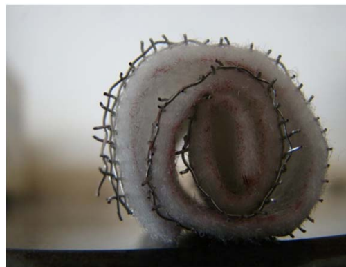
Fig. 2: Pictures of fibrous matrix before cell immobilization (A and B)