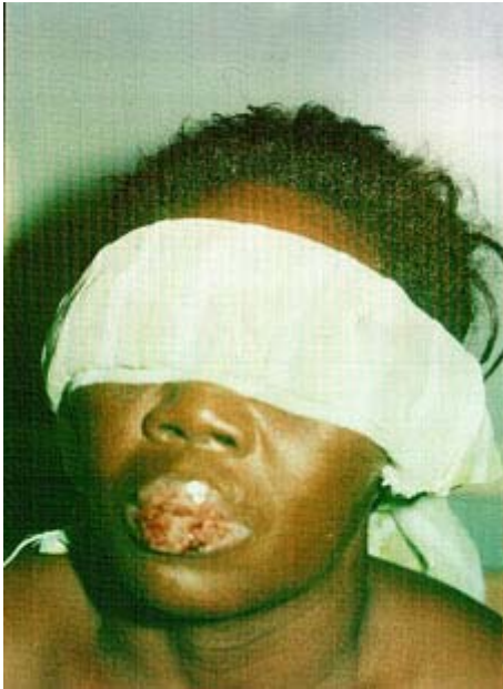
Fig. 1: Mother with SJS

case is presented due to the increase rate of drug misuse including antibiotics which may lead to death from severe drug reaction especially in the rural areas of Bayelsa state and the Niger Delta region of Nigeria.