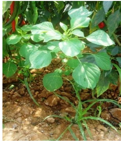
Figure 1: Legend for figure 1