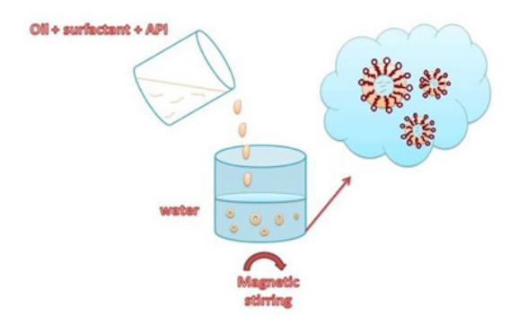
Fig 2: Formulation of SNEDDS

function of extent of dilution and variation in the pH/electrolyte content of aqueous phase need to be studied to characterize the final SNEDDS. To get an idea about the colloidal stability the zeta potential of the SNEDDS should be evaluated. The nanoemulsion droplets morphology can be studied by transmission electron microscopy. Various dissolution media have to be adopted to study the invitro dissolution profile of SNEDDS. The chemical stability of the drug in SNEDDS should be evaluated by carrying out long-term storage stability studies<sup>9</sup>