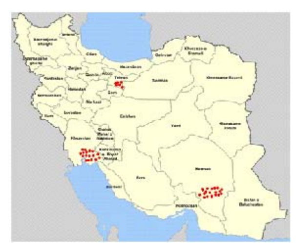
Fig.1: The map of sampling localities, including the studied provinces