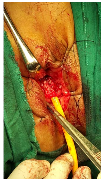
Fig. 4 . The graft's mucosal surface is sutured facing the urethral lumen