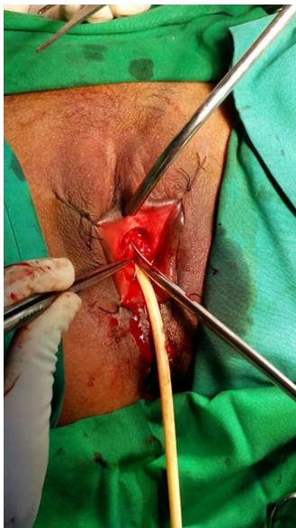
Fig. 3. The incision on the urethra is made at the 12 o'clock position