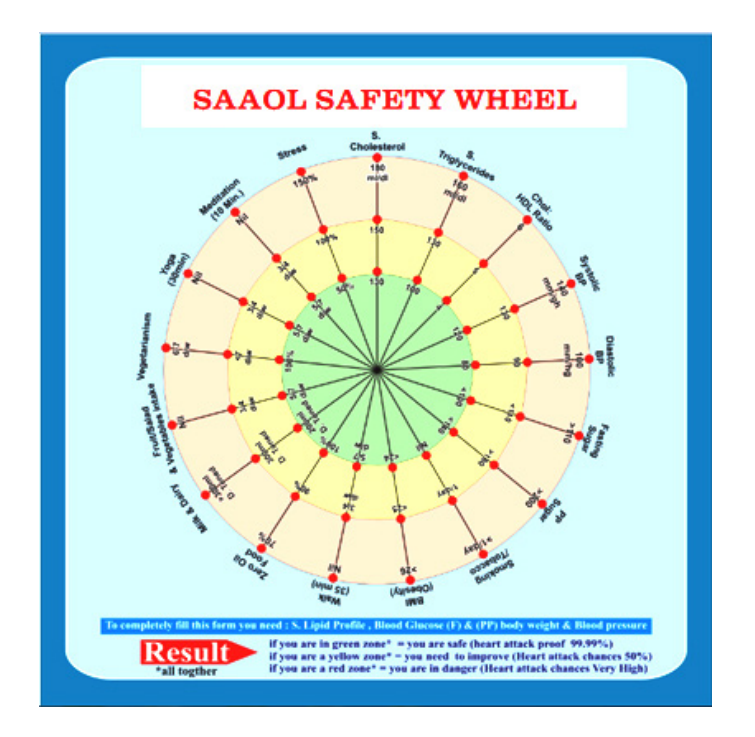
Table 3. Baseline demographic characteristics of participants