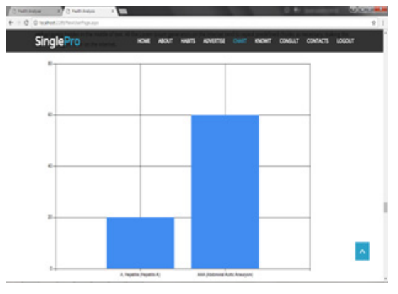
Fig. 8: Graph on health status

several snapshots. The database table is taken for our implementation.