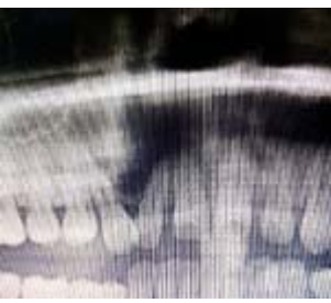
Fig. 2 & 3: Showing panoramic view showing a unilocular radiolucency with divergence of 12 and 13